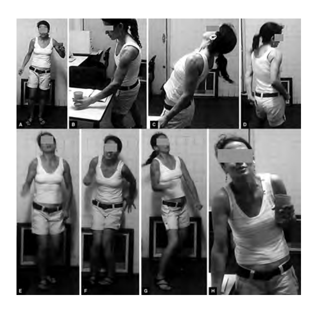
Figure 5. The patient, a 37 year-old woman, walks normally when sustaining a glass of water (A). After droping it (B), sudden body distortion movements and dystonic walking immediately occur (C-G), ceasing only when she holds the glass again (H). Images extracted from a movie kindly provided by Doctor Adriana Fiszman.

Treatment approach is beyond the scope of this article, but it is worth mentioning that no standard therapy for this problem is available. Treatment needs to be individualized and depend on the psychogenic factors involved<sup>9</sup>. Dramatic cure is the best diagnostic evidence of conversion<sup>9,10</sup>. Offering a placebo medication or for instance applying a tuning fork to the affected body part often eliminates the symptoms<sup>18</sup>. However, the disorder is never a piece of cake. Anxiety and depression are the commonest psychological accompaniments of conversive gait disorders, sometimes requiring specific treatment. Some patients respond quickly to psychological management,