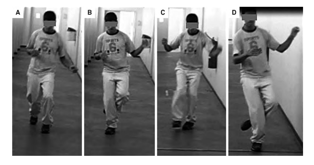
Figure 4. A 18 year-old men who with a 4 months duration walking with knee give way-and-recover pattern and place his leg behind the support leg with each stride. Images extracted from a movie.

and knee give way-and-recover (5), were the most frequent in that study.