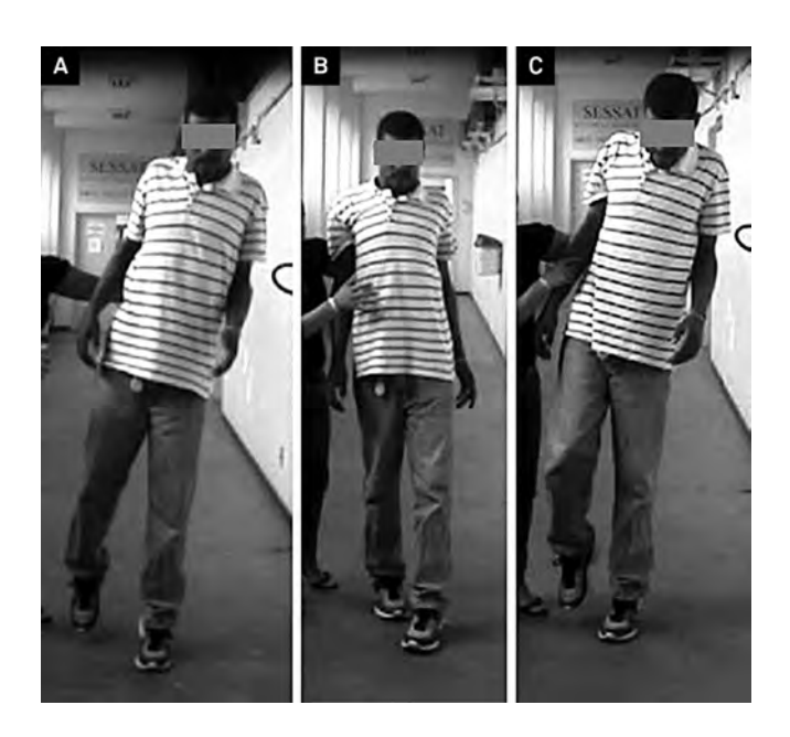
Figure 3. A 36 year-old men present for five years walking with extremely slow movements (moon walking or slow motion). He modifies this pattern on request (see Figure 6). Images extracted from a movie.

Gait examination is the best single test of neurological function. Walking reflects motor, sensory, vestibular and