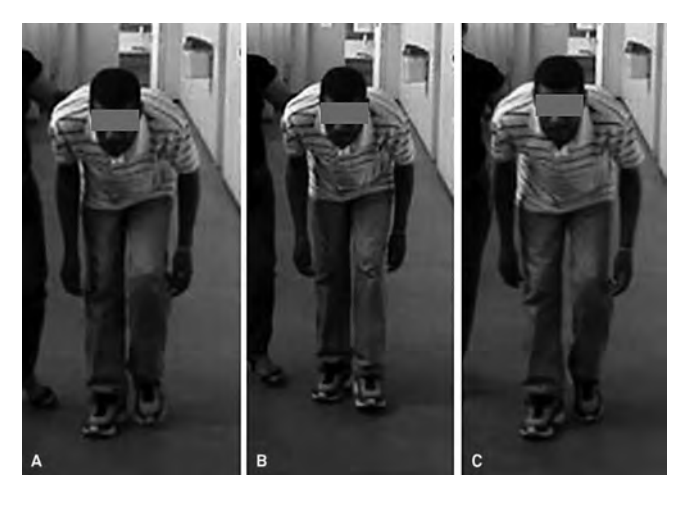
Figure 6. When asked, the subject changes his slow motion gait pattern (see Figure 3) and trembling gait (not show), to a camptocormia. Images extracted from a movie.