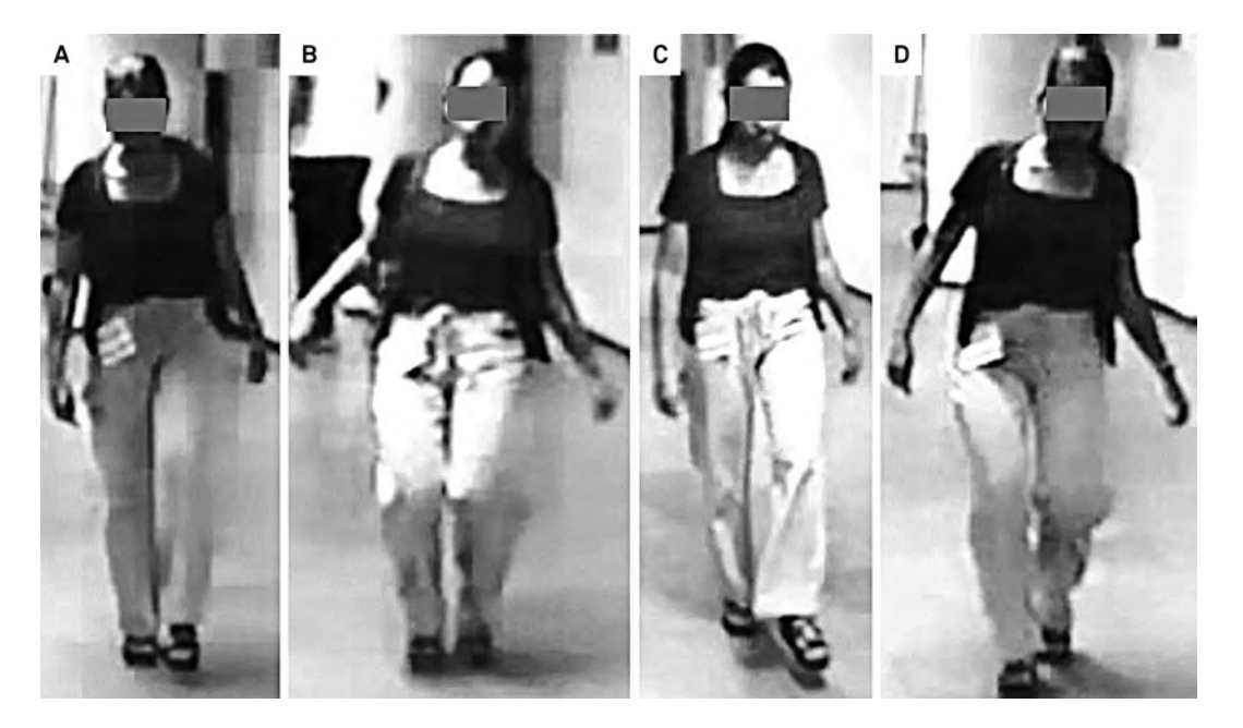
Figure 1. Knee give way and recovers. The patient was a 25 year-old woman presenting for 2 months gait characterized by suddenly flexing the knees in every step without falling. Images extracted from a movie.

The clinical data are summarized in the table. Four conversive gait types present in 23 (92%) patients. Successive knee give way movements presented as sudden buckling of the knees without falls (Figure 1) was the most common gait variant: 8 individuals (32%), followed by monoparesis in six (24%), subdivided in dragging (2), stiffness (3) (Figure 2), and foot drop (1). Tremulous gait occurred in five patients (20%), four show slow motion gait (16%); and one presented typical "moon walking" (Figure 3). Dystonic gait was evident in three patients: one walked with inverted feet (scissor feet); another flexed one leg while placing the opposite foot behind the knee (Figure 4); and a third walked with bizarre multiple contortion movements without falling. After one-year treatment patient could improve substantially her gait by sustaining a glass of water while walking (Figure 5). Ataxic and camptocormic (Figure 6) gaits were observed in one patient each. An old lady presented with a very bizarre walk characterized by short steps alternate, gorilla-like arms betting against the thorax and head bobbing. When stopped she would move all her body many times like a pendulum back and forth sway amplitudes in a crescendo-decrescendo way. Another woman moved quickly up and down while standing (vertical tremor). While sited she modified the movement pattern performing thighs adduction-abduction movements.